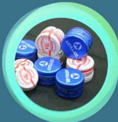
ROPP Aluminium Caps