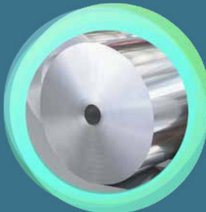
Plain and Printed Aluminum Strip Foils